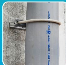
Single Pipe Bracket System