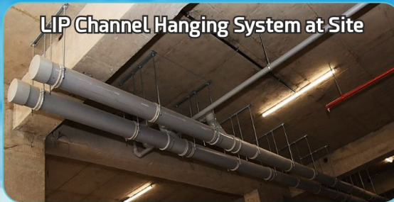
LIP Channel Hanging System at Site