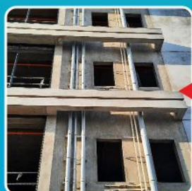
S4 Channel System at Site